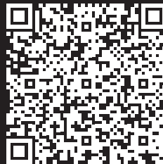
Episode 2. Legislative Amendments and Bank Turnovers. 23 December 2018