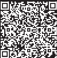
Episode 3. State Guarantees. 3 March 2019