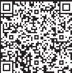
Episode 1. Selective Justice. 2 December 2018