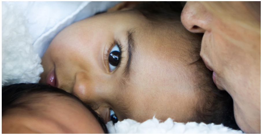
Ahna Tessler - Alamy

are simply individual characteristics of who we are. But until we get there, we probably need identities and labels to claim the respect all diversity deserves. Of course, not forgetting that all people share universal human rights regardless of who we are: we are equal and we are different.